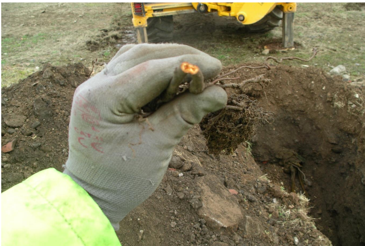
March 2017: Viable Japanese knotweed fragments identified. Fragment recovered from 2.6 m depth.