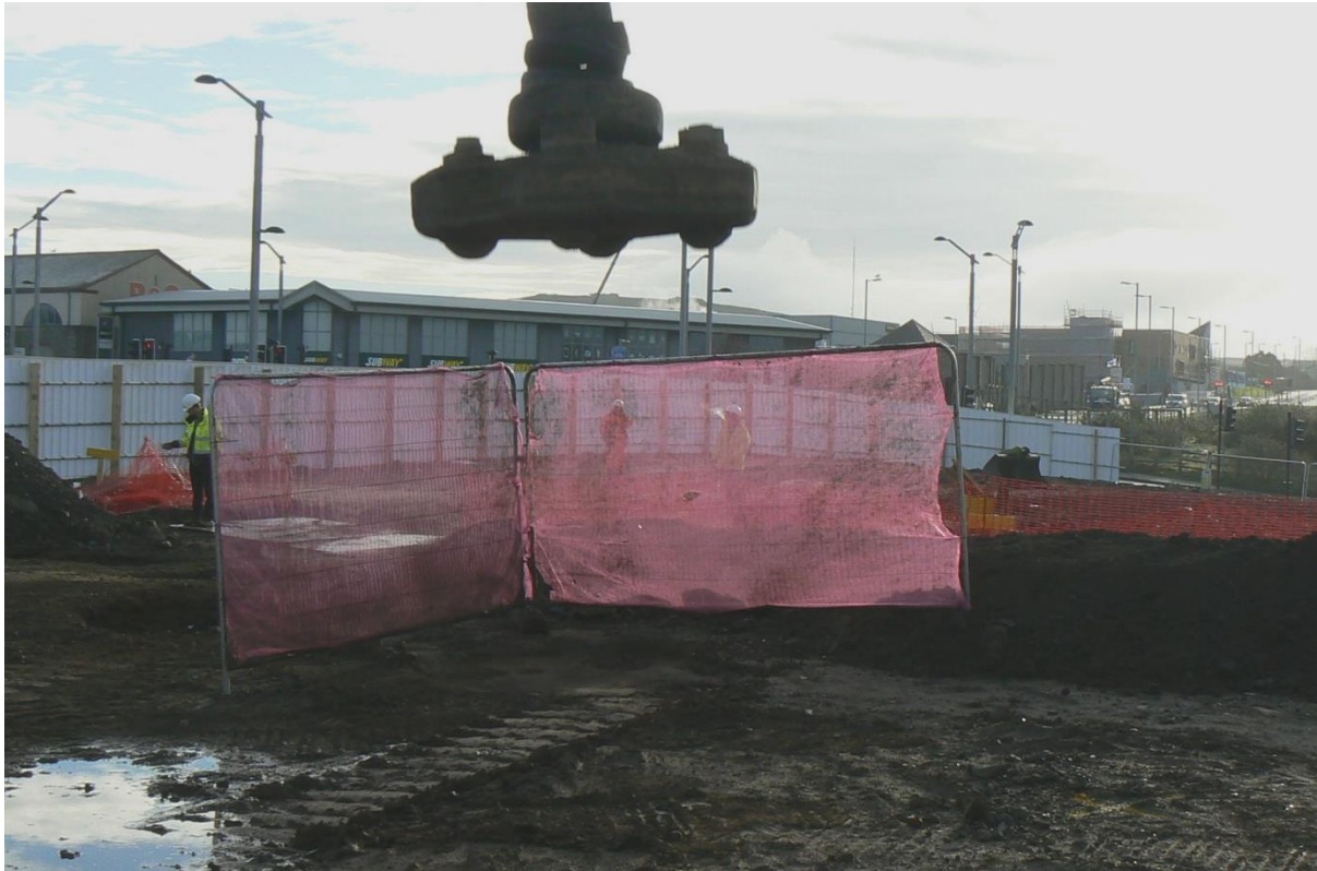
Nov/Dec 2017: Dynamic compaction on site.