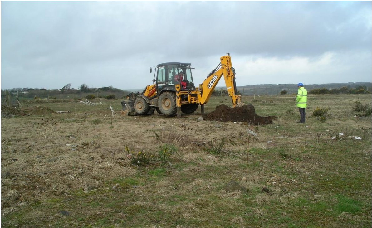
March 2017: Trial hole investigation in progress.