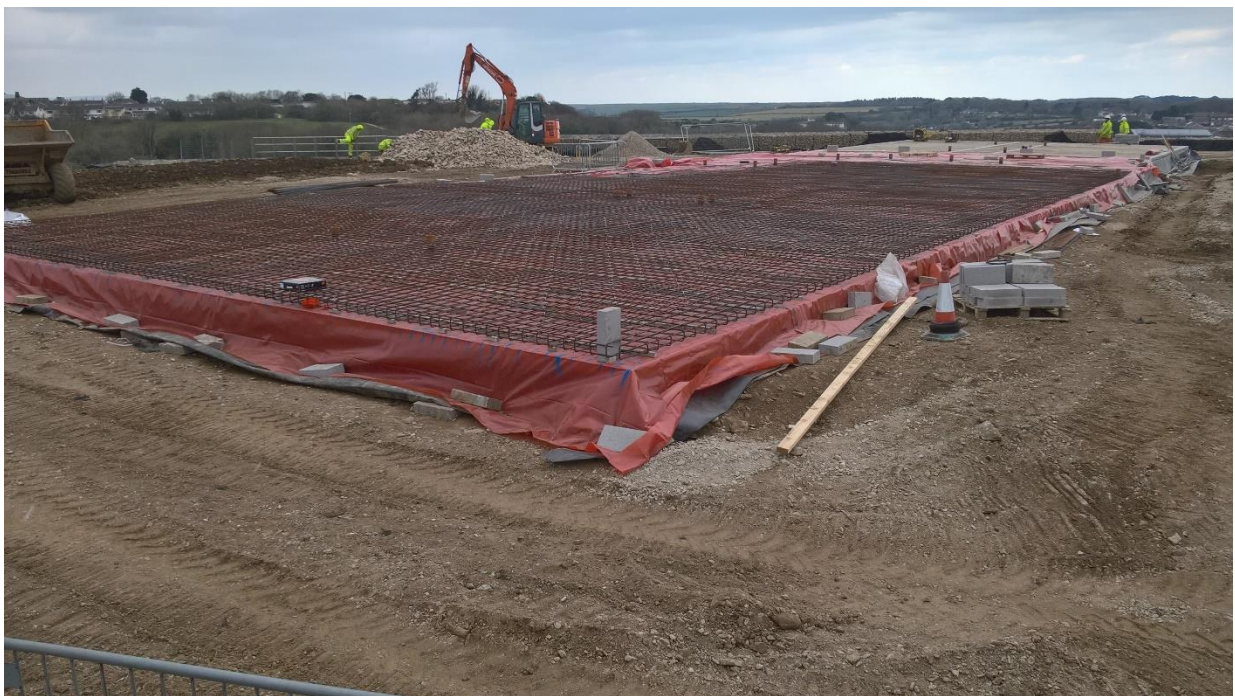
February 2018: Works in progress for new Travelodge. Note radon barrier (red) and Japanese knotweed root barrier (black).