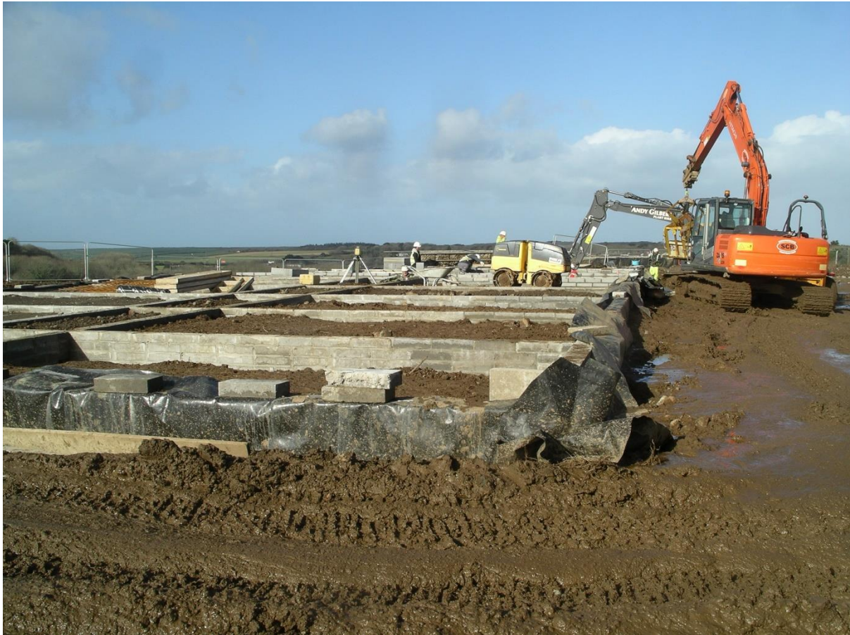
January 2018: Japanese knotweed barrier fitted under foundation.